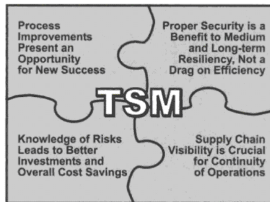
The core principles of TSM.

Value-Based Marketing, System Analysis - strategic management, Logistics. All of them gave rise to an ever-increasing and ever more precise - a holistic view of business accounting. Safety has always been one of the important elements shaping the business strategies.