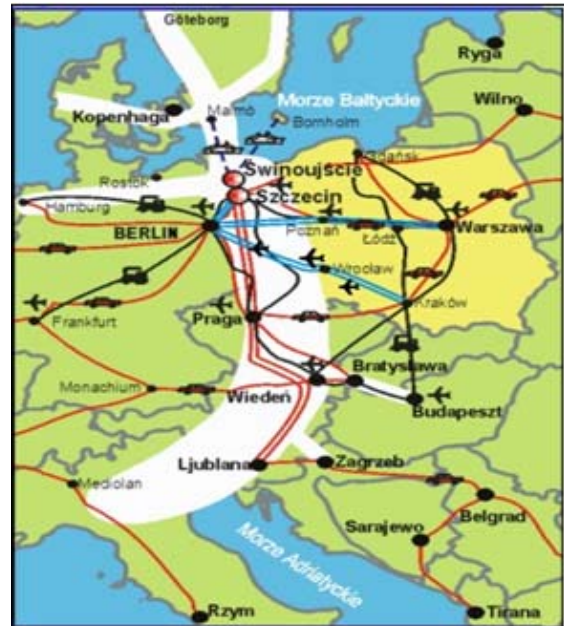
Fig. 3. Odra's transport corridor

Ref: Board of Marine Szczecin - Swinoujscie port. Szczecin 2009