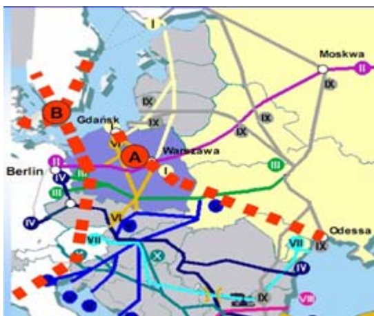
Fig. 1 Transeuropean transport corridors in Poland

References: The meaning of sea-land logistics centres in short sea shipping development in relations with Polish ports. Publishing Internal Maritime Institute in Gdańsk, No 6418. Gdańsk 2008, s. 58