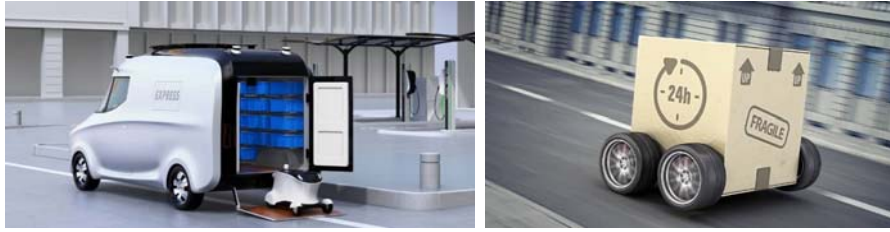
Fig. 1 A visualization of uncrewed road vehicles.