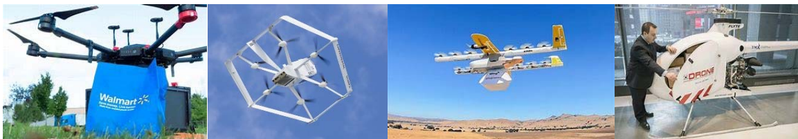
Fig. 3 Some examples of UAVs

Although there are attempts to use drones in cities, for now, it is more realistic to apply them in rural and sparsely populated areas, primarily for security reasons. For the same reasons, the weight of the transported cargo is small. Cargo drones must not transport larger sizes and masses in cities.