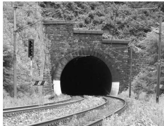
Fig. 4 Track block system

All existing systems need from time to time control and checking of quality and utility. One of the suitable methods is risk analyse.