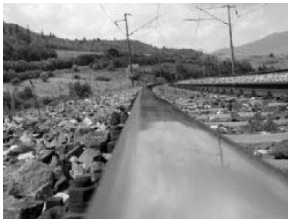
Fig. 6 Good protection – minimal risk