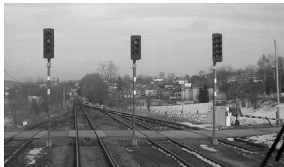
Fig. 3 Station interlocking plant

Serviceability of railway station depends on function of station interlocking plant. If these equipments are not working properly, we have to decrease transport capacity value.