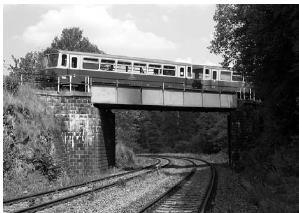
Fig. 5 Risk place on transport infrastructure

5. Impossible risk – we have to stop all activities and remake system of activities.