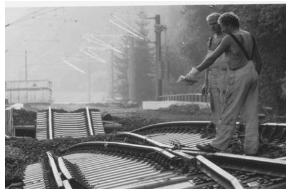
Fig. 1 Picture showing consequences of natural disasters

Every dangerous situation brings dangerous condition for drivers, policemen, firemen, aid men and the others participants on dangerous situation.