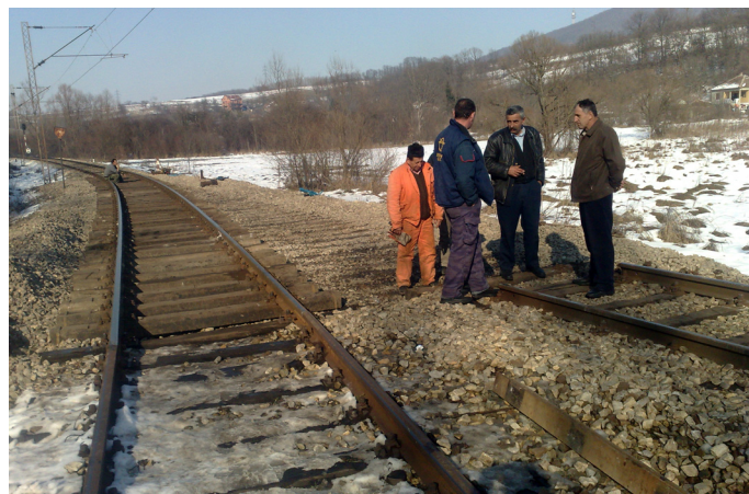
Fig.4 Switch from the Belgrade-Nis track to the ABS Minel Transformatori factory in Ripanj

By shipping the step-up transformer onto the ingoing/outgoing factory track of ABS Minel Transformatori in Ripanj (figure 5), the entry of the transformer into the assembly/disassembly hall of the factory was enabled. Here, the unloading took place and the unit was placed on a special cart wheel to transport it inside the hall. Upon unloading the transformer, the Schnabel wagon was prepared for no-load stroke and returned via rail to Austria.