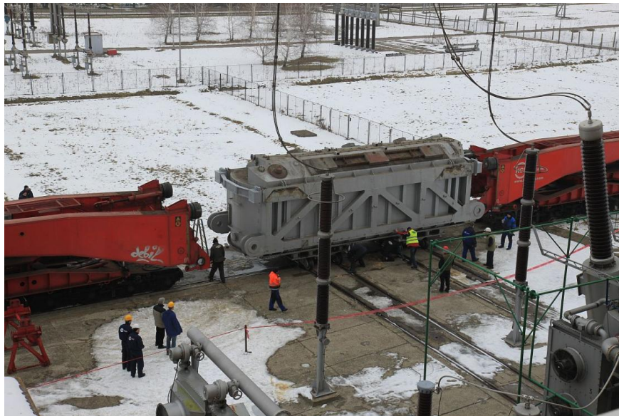
Fig.3 Transformer 725 MVA on the loading position for the “Schnabel” wagon at thermal power plant TENT B in Obrenovac

All this was done in less than 6 hours, in order to maintain regular railway transport on the Belgrade-Nis line (figure 4). The transport of energy transformers is carried out by the Schnabel wagon being drawn by a diesel engine, because due to electromagnetic phenomenological occurrences that can arise between the contact grid and the active part of the transformer, the electric contact grid for charging the electric locomotive must be shut down.