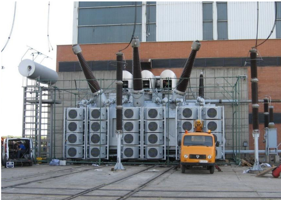
Fig.1 Step-up transformer CEM 725 MVA, in thermal power plant TENT B in Obrenovac

the transformer oil is 90 tons, and the transport weight is around 360 tons. This step-up transformer has been in exploitation since 1983 (figure 1), when thermal power plant TENT B with two 620 MW power units was let into operation. This is one of the biggest energy transformers in the Balkans, transforming an eighth of the total electric energy produced in the Republic of Serbia.