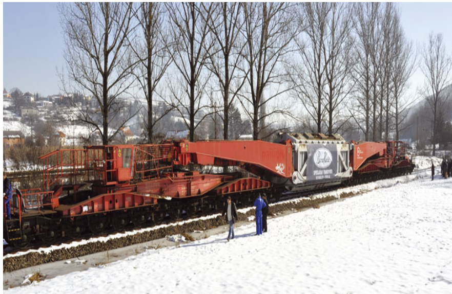
Fig.5 Entrance of the Schnabel wagon into the ABS Minel Transformatori factory in Ripanj

Disassembly was performed upon completed transport, to establish the detailed damages because of the accident, test the functional characteristics and damages of the step-up transformer, so as to make the final decision on its revitalization and general overhaul. It was decided for new LV and HV coils to be made, to install new insulation arrangements and to fit in a new magnetic circuit because of damages that were identified on the magnetic circuit's insulation. The costs of overhauling this step-up transformer of capital worth for the TENT B thermal power plant in Obrenovac and the Serbian Electric Power Industry are around EUR 3.5 mn.